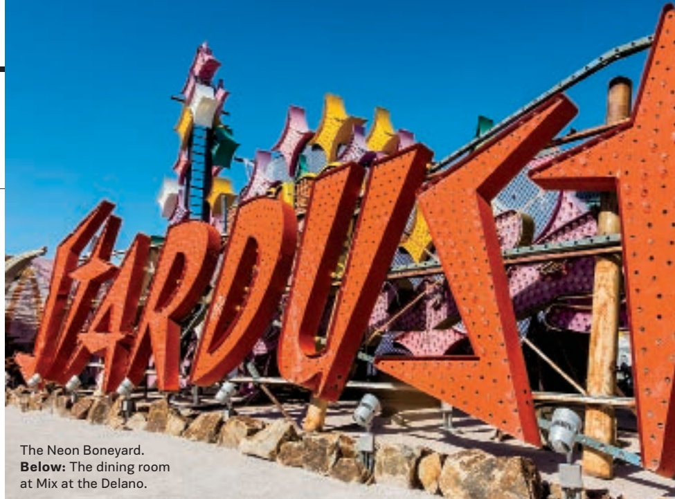
The Neon Boneyard. Below: The dining room at Mix at the Delano.

A lighting product that alleviates jet lag would be cool.