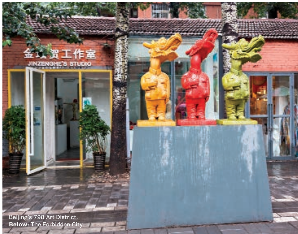
Beijing's 798 Art District. Below: The Forbidden City.

Learn about packing a suit, beating jet lag, and more at our dedicated business travel section: tandl.me/biztrv .