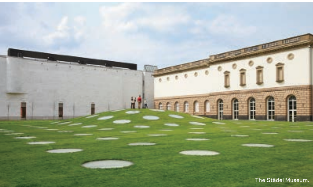
The Städel Museum.

Germany's efficient financial center has shaken off its boring reputation with a sophisticated mix of boutiques and cocktail dens.