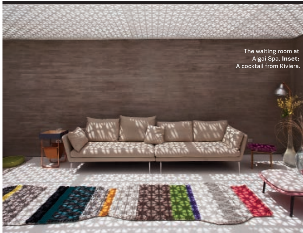
The waiting room at Aigai Spa. Inset: A cocktail from Riviera.