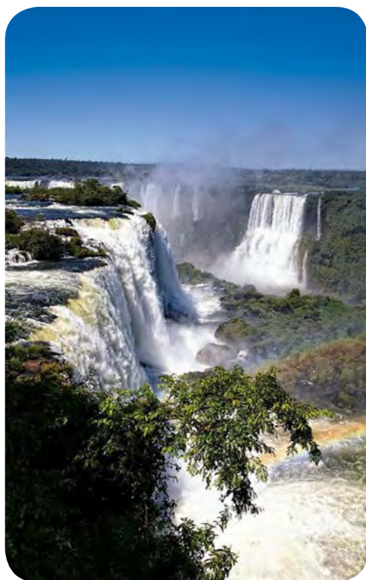
In the flow at Iguazu Falls (left), and a bird’s-eye view of Pantanal National Park (right).

To truly experience the region, your Virtuoso travel advisor can arrange a stay on an authentic farm such as Fazenda Barranco Alto. Situated in one of Pantanal’s most striking areas, this remote, family-run property includes a small, well-tended hotel for savvy travelers looking to experience exceptional trekking, horseback riding, and nocturnal safaris. Private hosts add even more value to your journey.